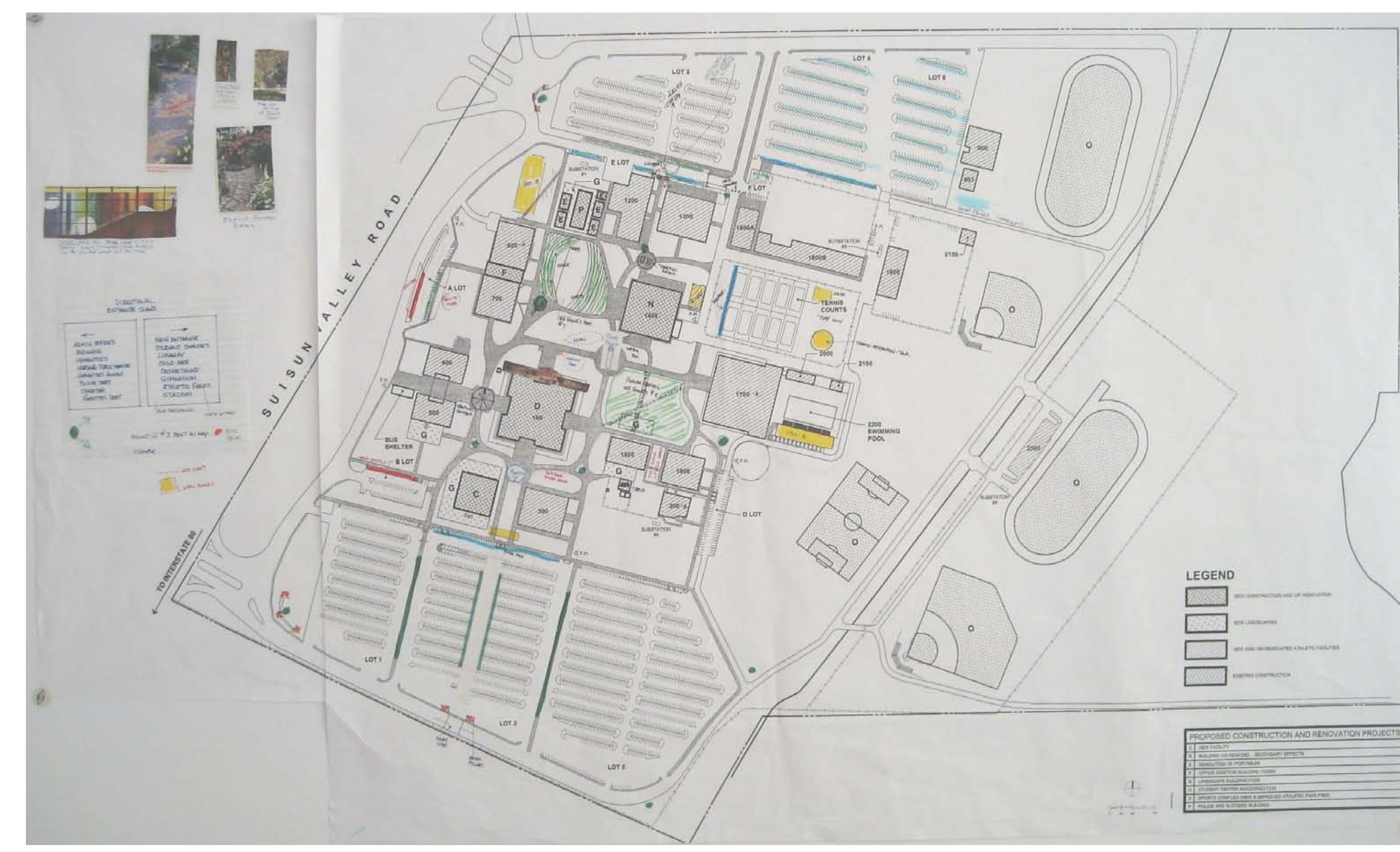
Appendix C Team 1 Plan